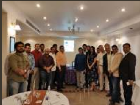
Sessions Conducted Onsite at your Hotel / Outlet